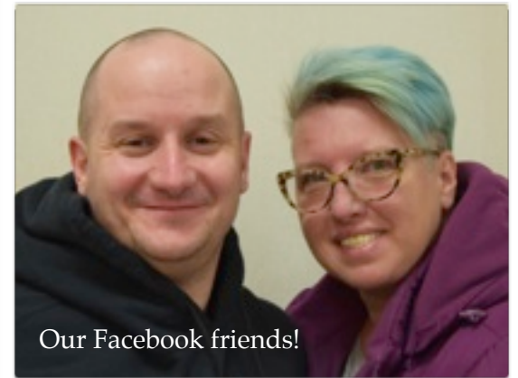
Our Facebook friends!

It is now time to start bringing in items to donate to baskets and raffles for the Night at the Races